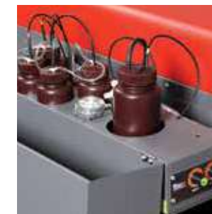
Bulk ink system with WIMS ink circulation and filtration