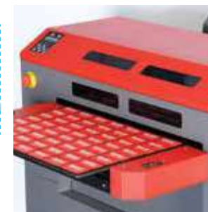
iUV-600s - Print area A2+ iUV-1200s - Print area A0-