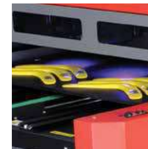
Dual water cooled LED lamps. 395Nm low heat